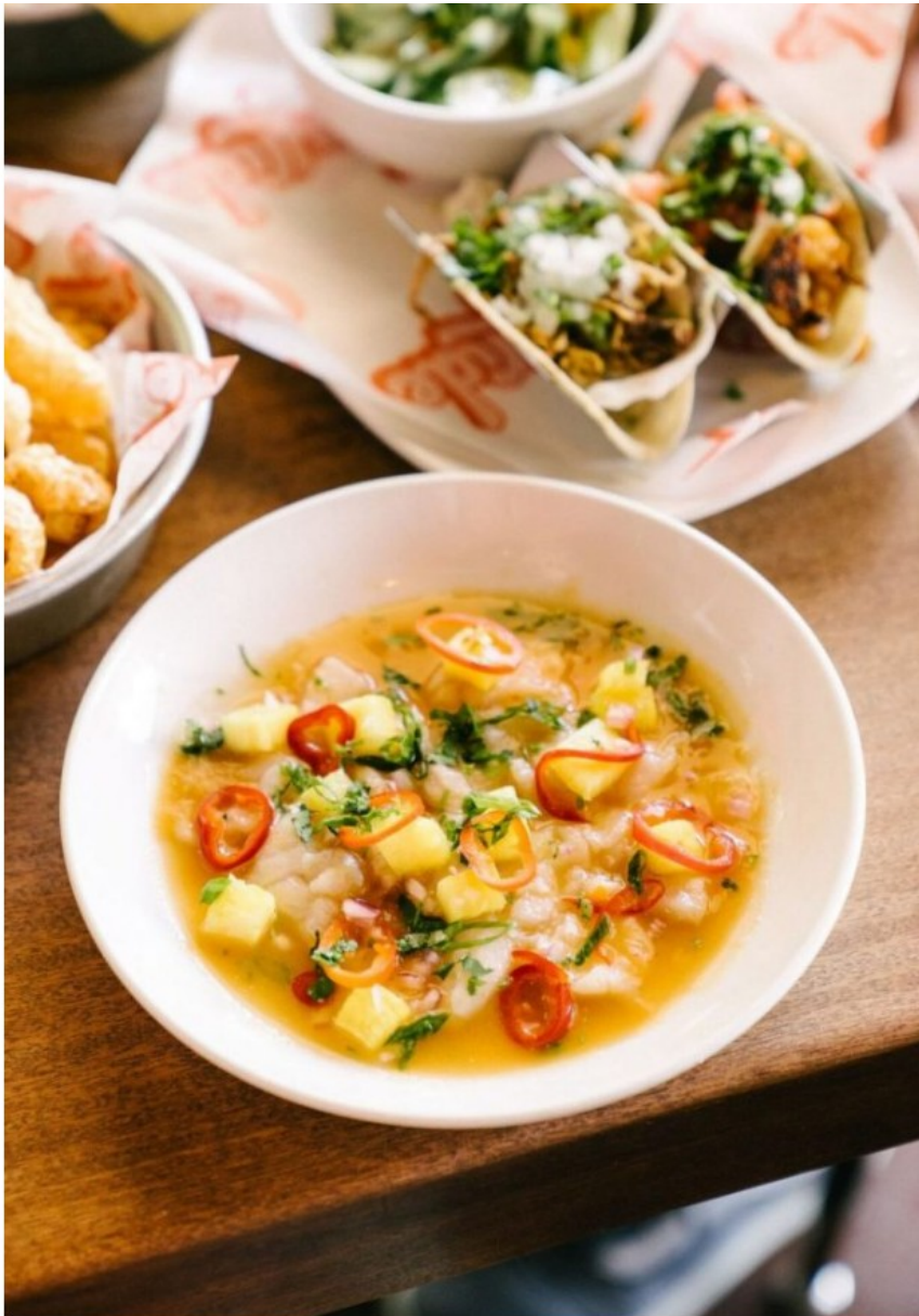
For a lighter bite, the fresh sea bass ceviche is an explosion of color and flavor with augachile rojo, pineapple, pickled fresno, red onions, cilantro and scallion. A true summer eat with a Southwestern twist, the watermelon and pepino is a standout (for the mouth and Instagram). Covered in a house chamoy (a sauce that's fruity, sweet and spicy all at once), pepitas, queso fresco and mint, this was gobbled up in minutes.