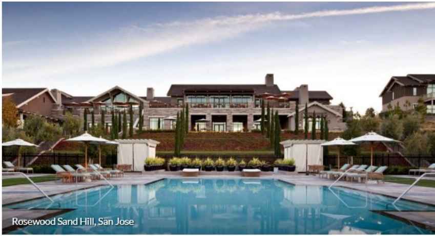
Rosewood Sand Hill, San Jose

Inspectors stay a minimum of two nights, but sometimes much longer and do everything themselves, like make their own reservation and beyond. After extensively evaluating the property, the inspector then submits their report to headquarters where a company algorithm works its magic to reveal the final rating. That's right, inspectors don't even learn what the rating is until you do when the yearly list is revealed to the public.