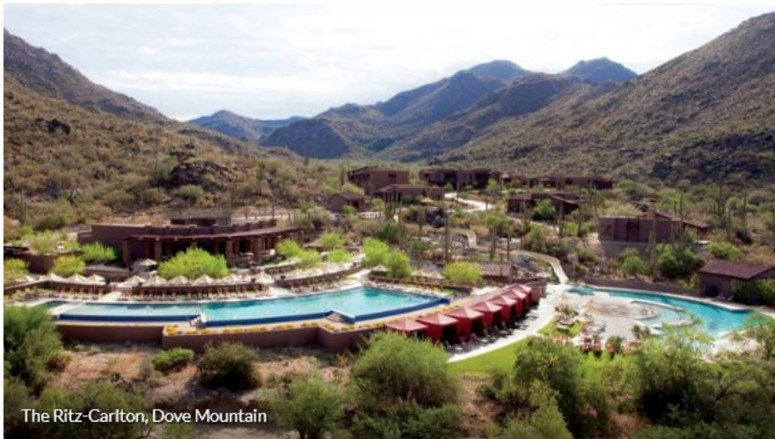
The Ritz-Carlton, Dove Mountain

To keep hotels on their toes, inspectors won't visit multiple hotels in one destination and the profile of the inspectors for each hotel is changed every year. From a solo business traveler to a European family, the change-up allows FTG to look for consistency in service, no matter who's booking a stay.