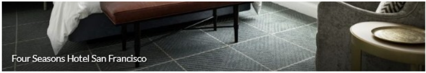
Four Seasons Hotel San Francisco

Be on the lookout for the 2019 ratings, releasing in February. But for now, why not book a stay at one of Arizona's star-studded winners. Five-Star winners include The Canyon Suites at The Phoenician and The Ritz-Carlton, Dove Mountain (closed through Sep. 4 for renovations). Local Four-Star winners include Four Seasons Resort Scottsdale at Troon North ; L'Auberge de Sedona ; The Phoenician, A Luxury Collection Resort ; Royal Palms Resort and Spa ; and Sanctuary on Camelback Mountain Resort & Spa .