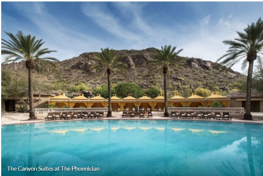
The Canyon Suites at The Phoenician

Stars, hot lists, gold awards, reader's choice...and so on. With so many award titles tied to the hospitality industry, it's hard to know what any of them mean or how they're determined. Here, we take a look into the Star-rating of Forbes Travel Guide (FTG), one of the most coveted recognitions that a hotel can receive.