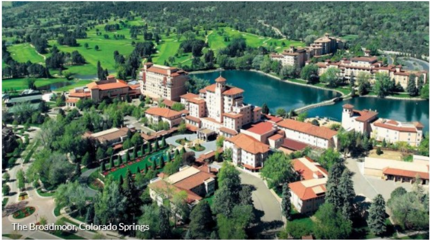
The Broadmoor, Colorado Springs

If you want the trifecta of luxury, just 13 hotels in the world were awarded Five-Stars for their hotel, restaurant and spa. Lucky for you, six of them are just a state away: The Broadmoor , Colorado Springs; Fairmont Grand Del Mar , San Diego; Mandarin Oriental , Las Vegas; Meadowood Napa Valley ; Montage Laguna Beach ; and Wynn Las Vegas .