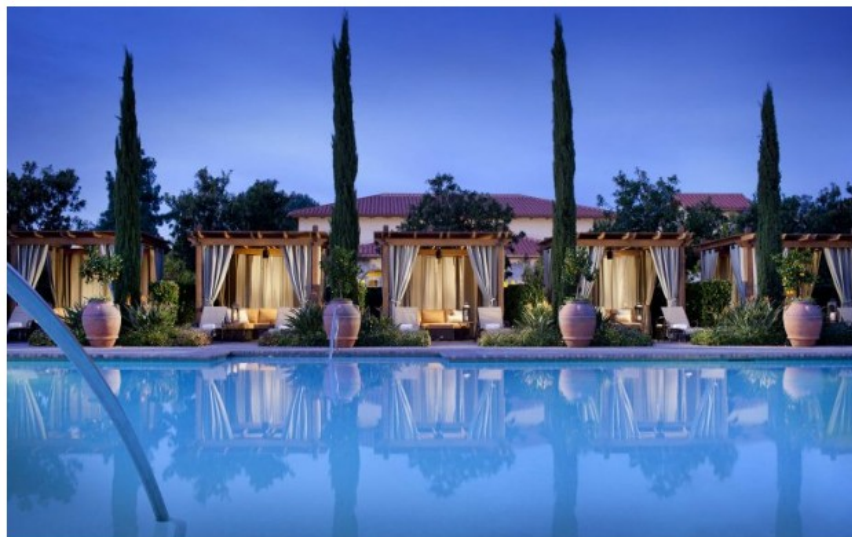
Spa Pool Cabanas

For starters, the rooms have a cozy feel with charming character. Wood-beamed ceilings, warm interiors and shutters that open up to a private balcony make this somewhere to curl up with a cup of coffee while taking in the towering trees and rolling green hills. While the hotel has a boutique feel, it has all the amenities of a large resort so you get the best of both worlds.