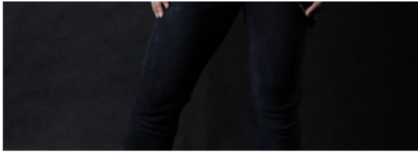
Arnel Pineda