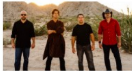
Celebrate the Fourth in Southwest Fashion with Roger Clyne and The Peacemakers