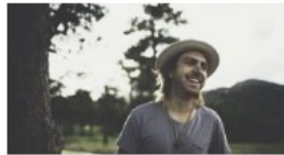
Trevor Hall: The Fruitful Darkness Pt. 1