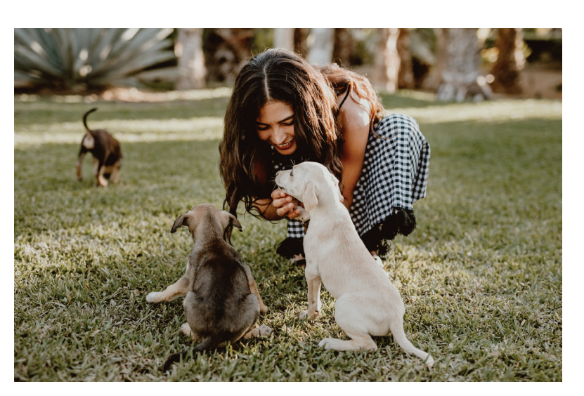
FOR A FULL LIST OF SHELTERS, VISIT INMEXICO.COM

If you're looking to meet your next furry best friend, here's Janice's tips for a smooth adoption process. And for those adopting from SPCA PV, the shelter does all the below for you, so you can focus on loving your new companion as much as they love you.