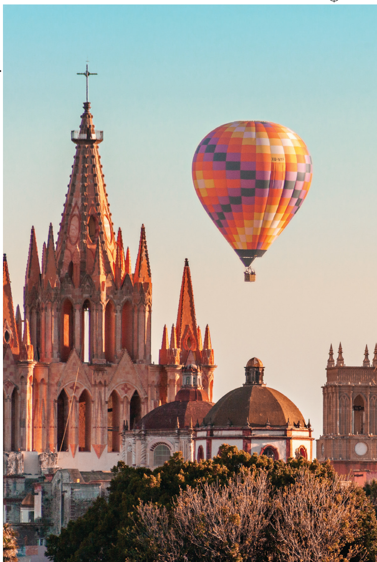
Clockwise from top left: La Parroquia de San Miguel Arcángel, Belmond Casa de Sierra Nevada, Moxi, Hotel Matilda, view of San Miguel de Allende